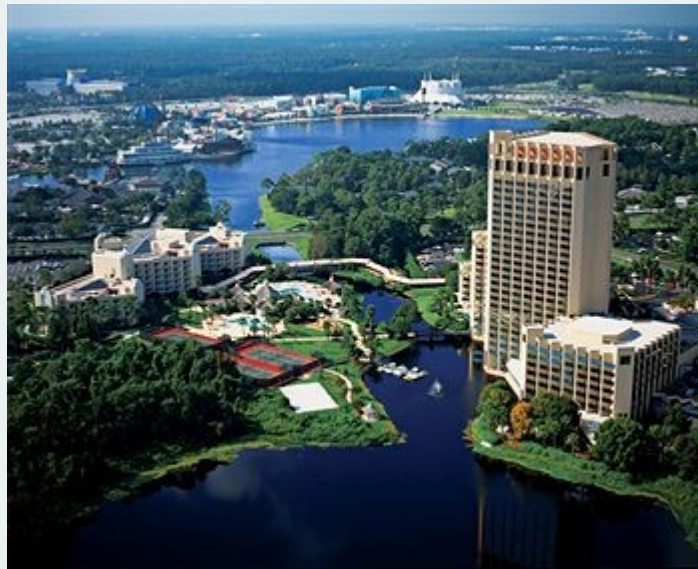
Enjoy the beauty of Lake Buena Vista, Florida during your stay.