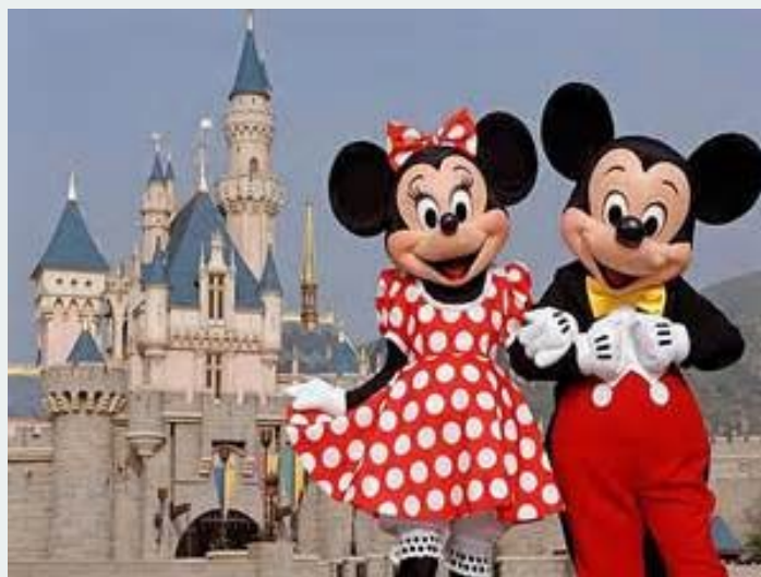
After an educational and informative experience at the Conference, enjoy the night life of Orlando and Disney World.