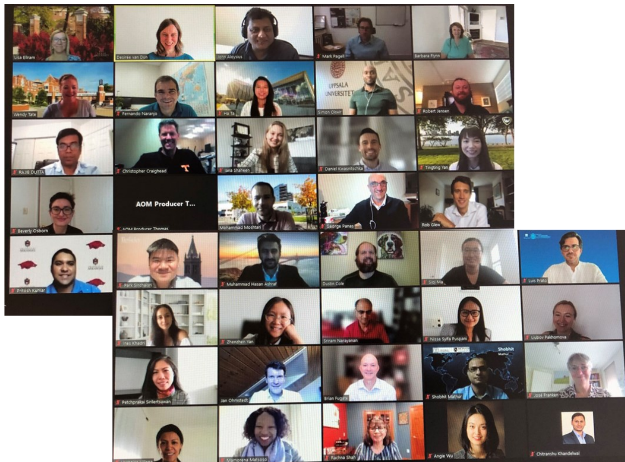
Consortium group picture: