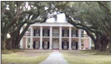
Oak Alley Plantation