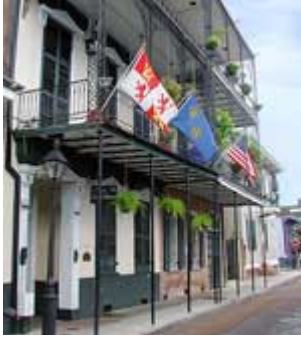
The French Quarter