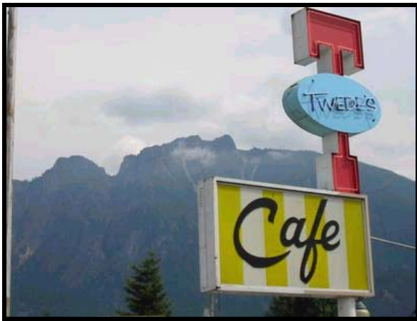
Twede's Café in "Twin Peaks" (North Bend, WA)