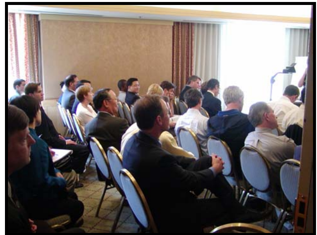
The OM Division

organizing this session and look forward to a repeat performance next summer. This allegiance between JOM and the Operations Division is particularly important since many of the papers presented in the division eventually get published in JOM .