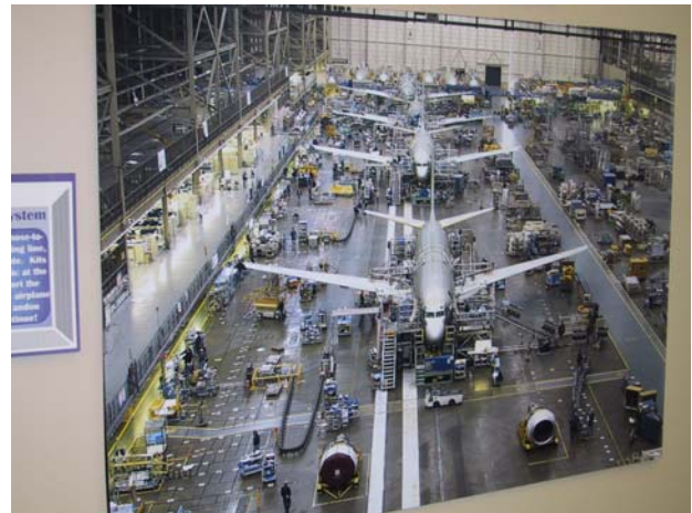
A view of the assembly line from the "bridge"

This year's conference theme, "Creating Actionable Knowledge," fits well with the domain of the OM division. The Academy encourages divisions to submit symposia and papers reflecting the theme. Even if your paper does not fit the theme, please submit your work!