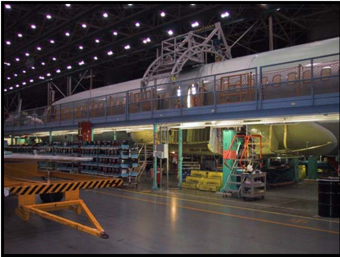
In the line at Boeing