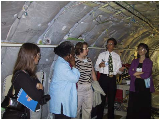
Inside the tube at Boeing

As you can see, we had a lot of "firsts" this year. Congratulations also to this year's award winners: