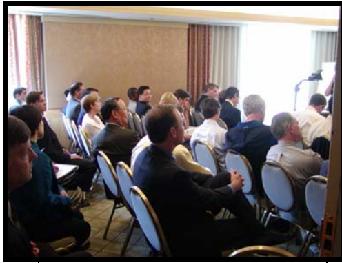
The OM Division in Action!