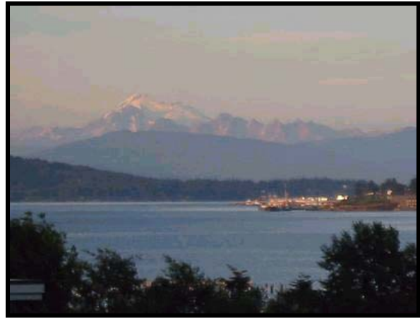
View of Mt. Baker from Anacortes, WA