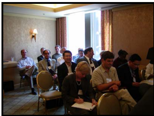
OM Division & JOM Best Paper Presentations

CMS serves as a new forum within the Academy of Management for the expression of views critical of established management practices and the established social order. CMS would like to encourage members of the OM Division to submit proposals for jointly sponsored symposia to OM and CMS. We will be innovating the design of our program. Our policy will be DEVELOPMENTAL, and we plan to use whatever time is allocated to us to program all submissions that fall within our domain, whether they be very short "concept papers," more substantial "work-in-progress," or fully-developed final products. To accommodate all these, our program will feature a mix of paper presentations, symposia, "roundtables," and "poster papers." So if your work has a "critical" edge, please do visit the CMS website: http://aom.pace.edu/cms/index.htm