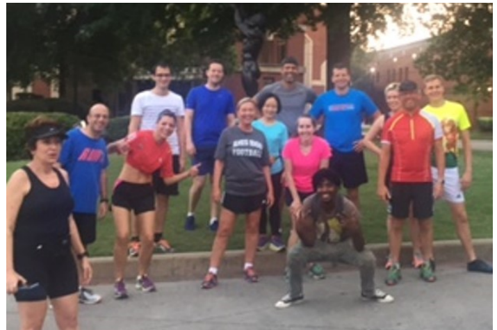
Our 2017 Sunday morning jog