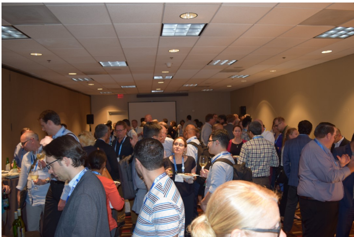
Our division reception during the 2017 conference